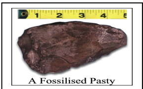
A Fossilised Pasty