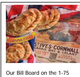
Our Bill Board on the 1-75